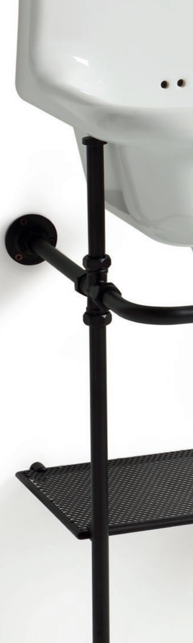
COD.TCL40C - 42 cm LAVABO SMALL SIZE SMALL SIZE WASHBASIN LAVABO TAILLE SMALL