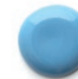
Azzurro Pastello 5024