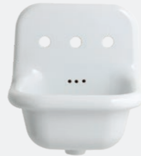
SMALL 42 CM