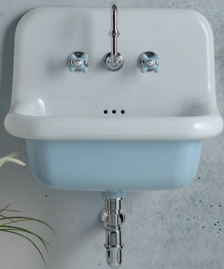
COD.TCL60C - 60 cm LAVABO MEDIUM SIZE MEDIUM SIZE WASHBASIN LAVABO TAILLE MEDIUM