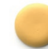
Giallo Senape Mat