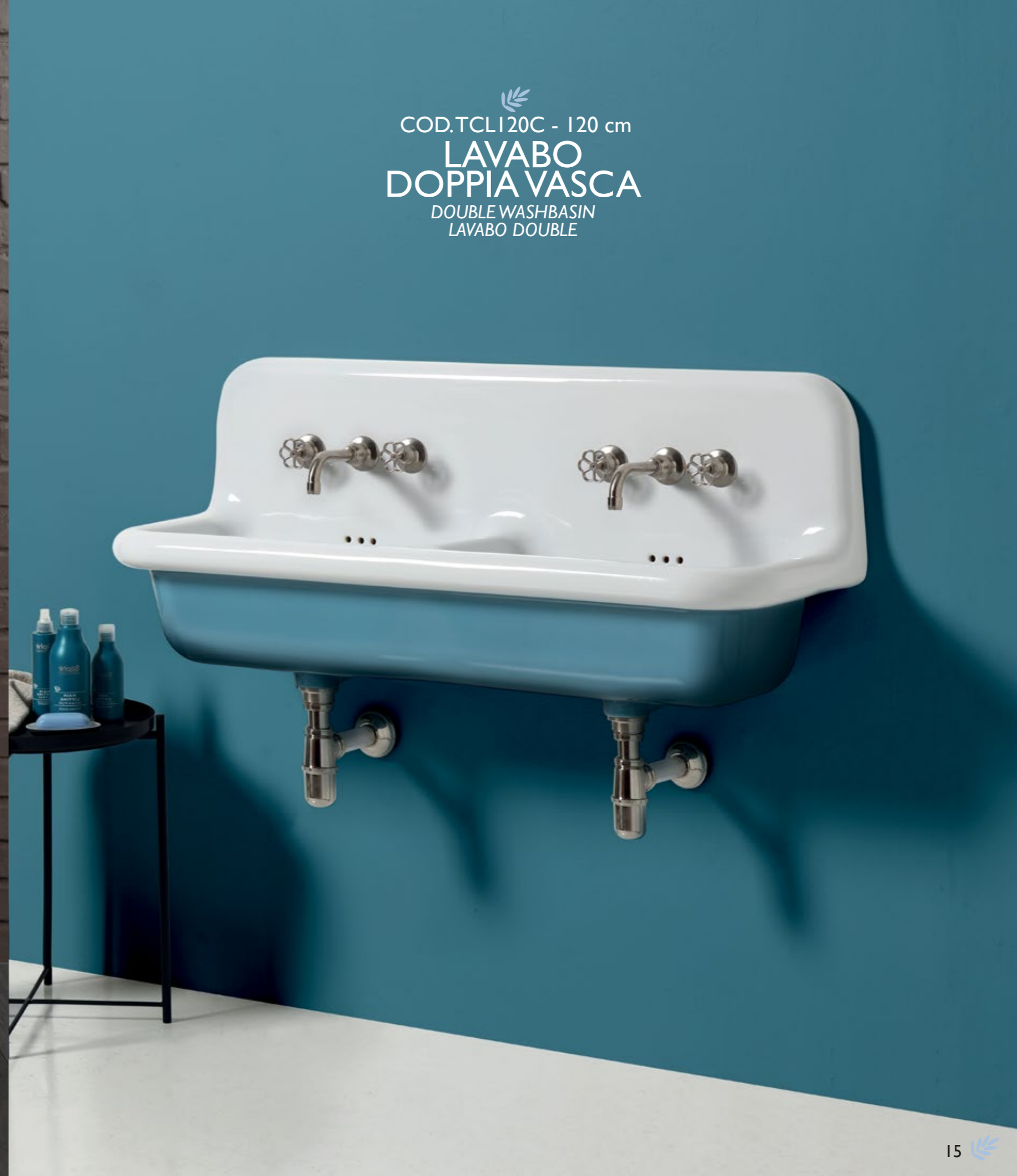
COD.TCLI20C - 120 cm LAVABO DOPPIA VASCA DOUBLE WASHBASIN LAVABO DOUBLE