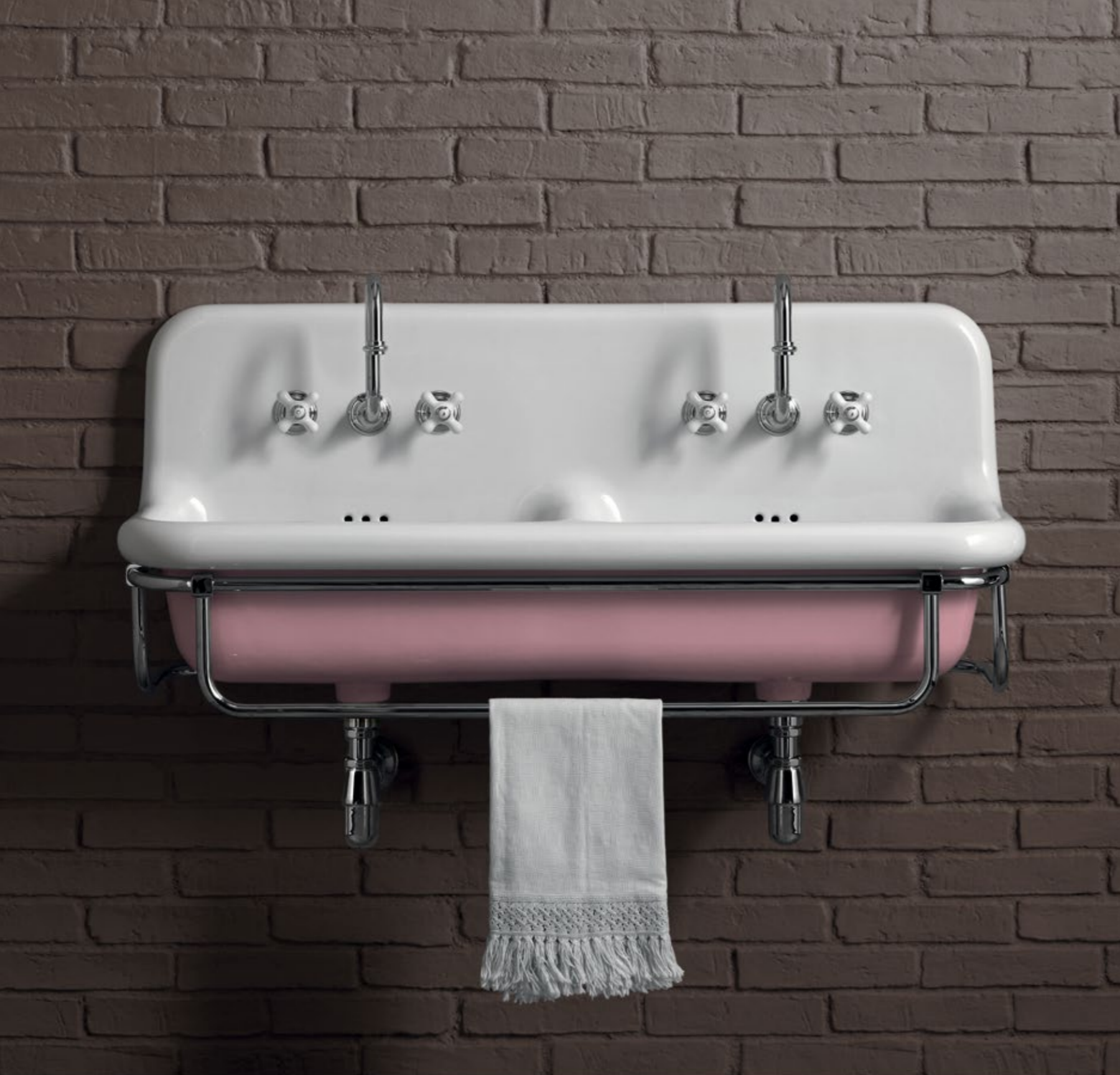
COD.TCI20PSR - 120 cm STRUTTURA SOSPESA WALL MOUNTED SUPPORT BASE SUSPENDUE