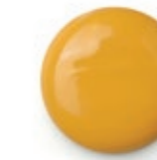
Giallo Senape Lucido