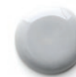
Grigio Chiaro 7035