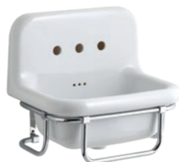
STRUTTURA SOSPESA WALL MOUNTED STAND PORTE-SERVIETTES SUSPENDU