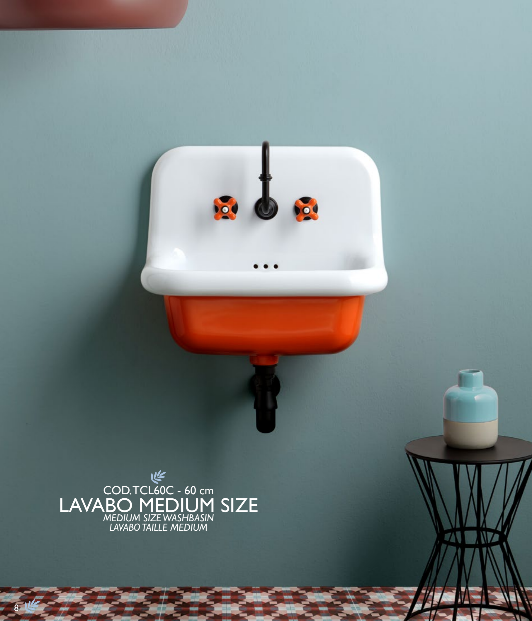
COD.TCL60C - 60 cm LAVABO MEDIUM SIZE MEDIUM SIZE WASHBASIN LAVABO TAILLE MEDIUM