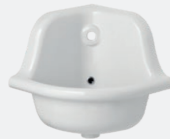
CORNER 42 CM