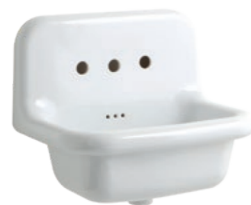
SOLO SUPPORTO A MURO WALL MOUNTED SUPPORT ONLY SUPPORT MURAL SEUL