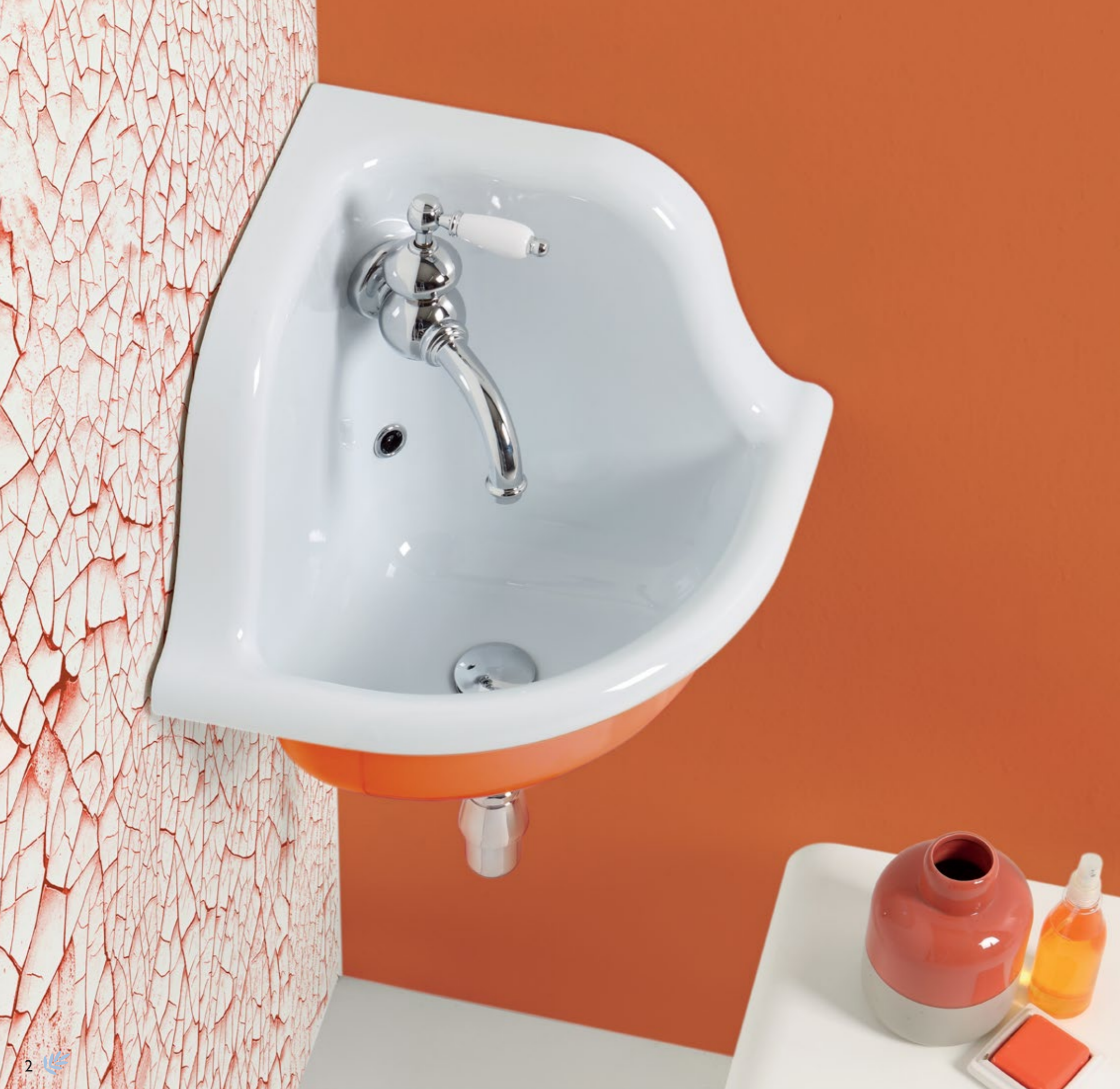
COD. TCL4040C - 42 cm LAVABO ANGOLARE CORNER WASHBASIN LAVABO DE COIN