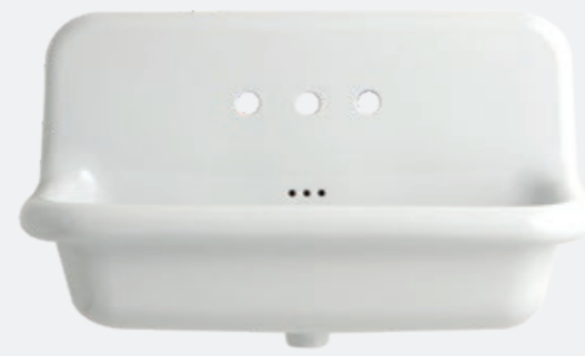
LARGE 90 CM