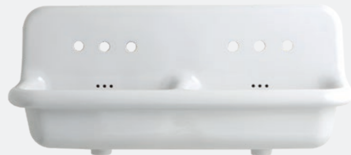
DOUBLE 120 CM