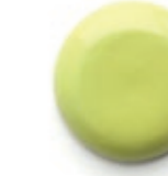
Giallo Limone 1016

I COLORI SONO INDICATIVI E POSSONO DIFFERIRE SU CERAMICA.