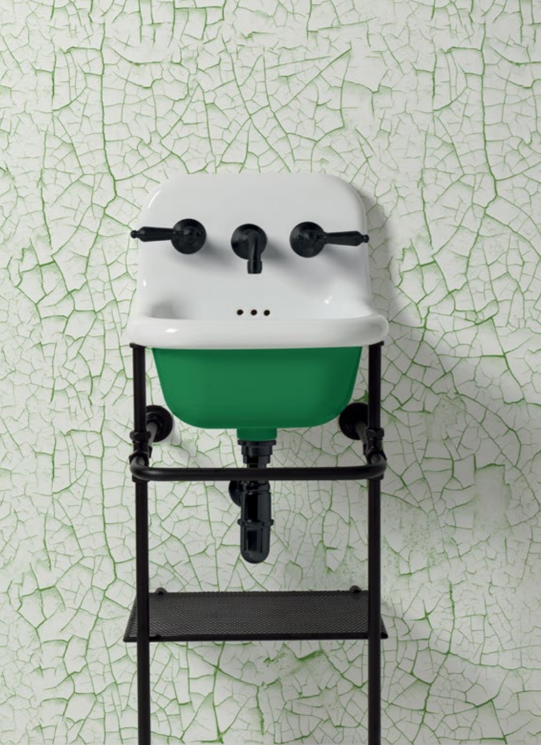
COD.TC40IBMRAL STRUTTURA A TERRA INDUSTRIALE METAL STAND WITH TOWEL RACK INDUSTRIAL BASE MÉTALLIQUE AVEC PORTE-SERVIETTES INDUSTRIEL