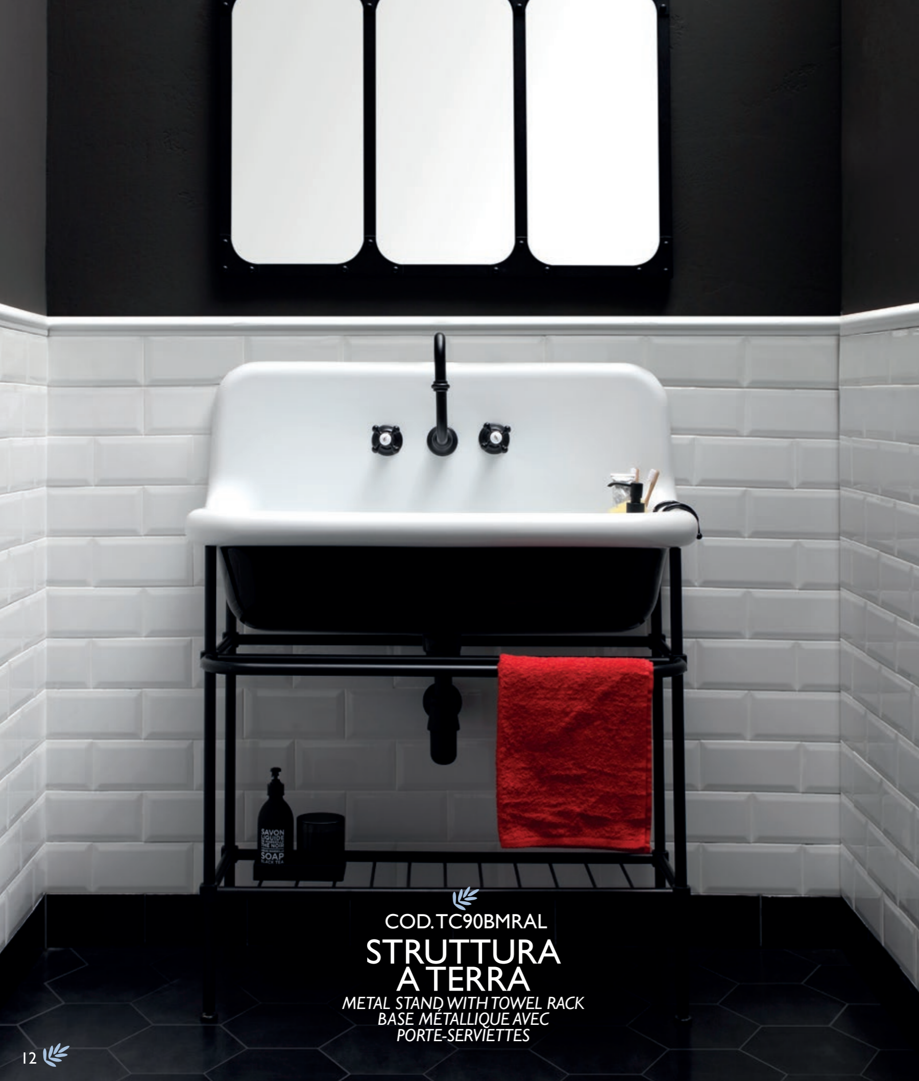
COD.TC90BMRAL STRUTTURA A TERRA METAL STAND WITH TOWEL RACK BASE MÉTALLIQUE AVEC PORTE-SERVIETTES