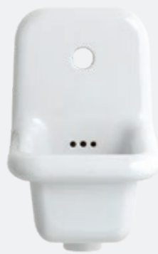
MINI 26 CM