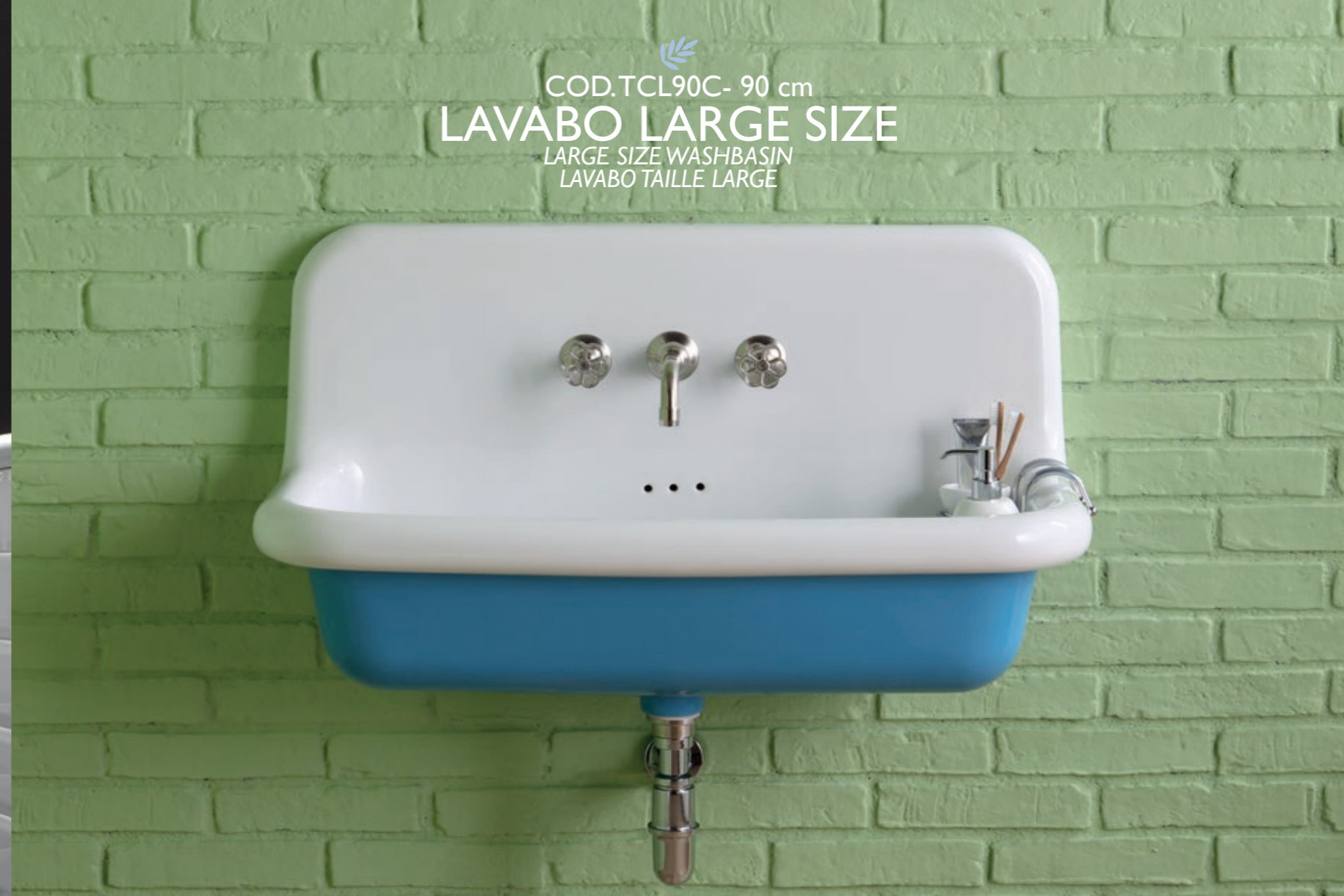
COD.TCL90C- 90 cm LAVABO LARGE SIZE LARGE SIZE WASHBASIN LAVABO TAILLE LARGE