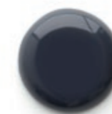
Grigio Scuro 7012