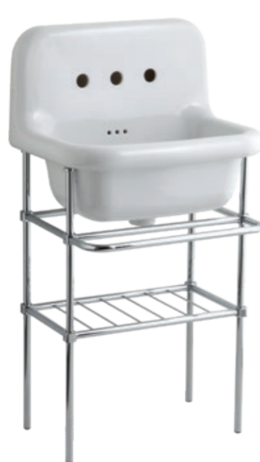
BASE TRUE COLORS