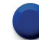
Blu Notte 5022