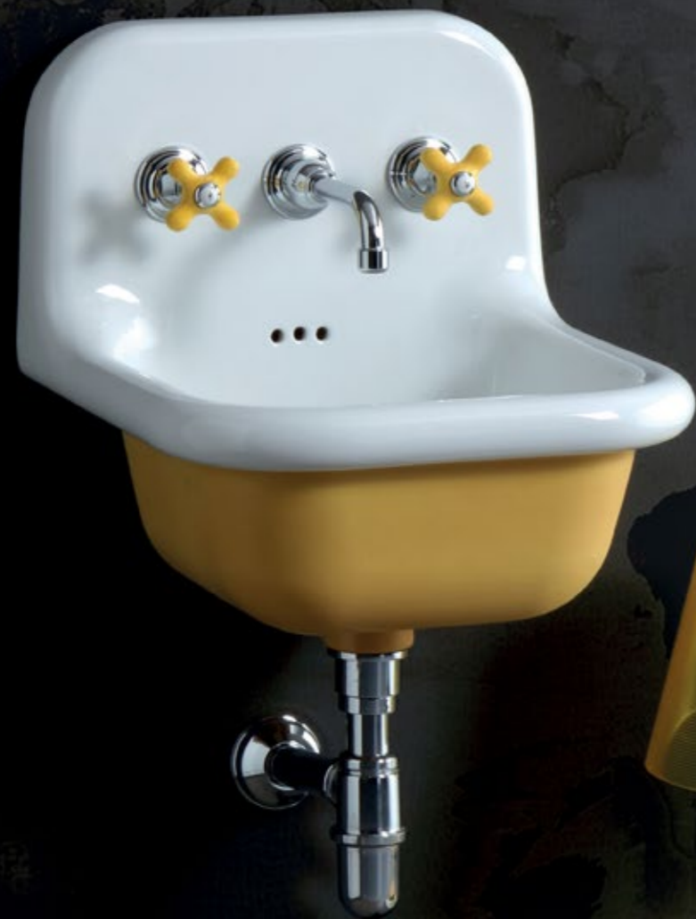
COD.TCL40C - 42 cm LAVABO SMALL SIZE SMALL SIZE WASHBASIN LAVABO TAILLE SMALL