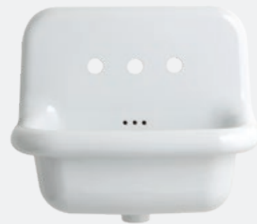
MEDIUM 60 CM